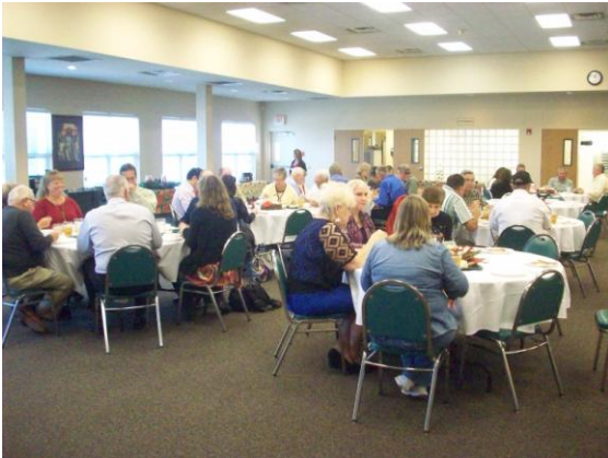
Enjoying homemade Chili

The December Luncheon was held on Thursday, Dec. 6 th at the First United Methodist Church. We would like to thank all of our chilli makers and everyone who attended. All the proceeds went to our local Ministerial Alliance.