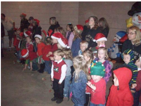
Children's Tree performing on stage in Park