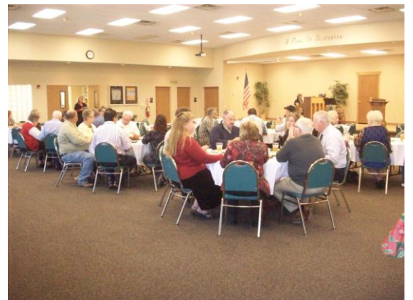
Catching up on the latest news among members during lunch