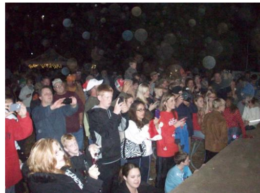
Crowd watching performers